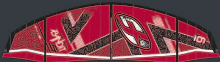
Red / Black