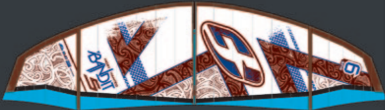
White / Brown