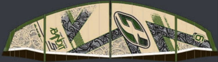
Beige / Kaki