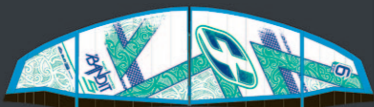
White / Blue