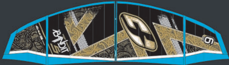
Black / Blue