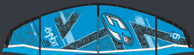
Blue / Black